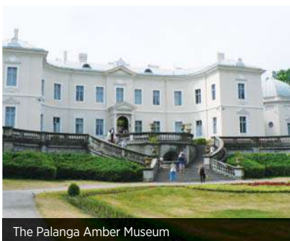
The Palanga Amber Museum

Lithuania is a land of history, architecture, and unspoiled natural beauty. From the beautiful architecture of the historic old town, to the banks of the Neris River, Lithuania is fast becoming recognised as one of Europe's gems. The capital, Vilnius, is an enchanting artists' enclave, with its timeworn courtyards, cobbled streets and baroque churches. And of course Lithuania's excellent and unique beer culture deserves special mention!