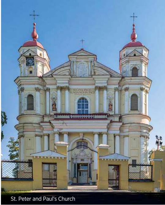
St. Peter and Paul's Church